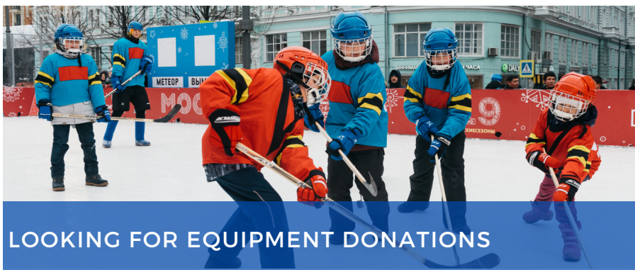
LOOKING FOR EQUIPMENT DONATIONS