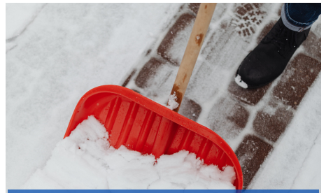
PLEASE REMEMBER TO KEEP WALKWAYS CLEAR