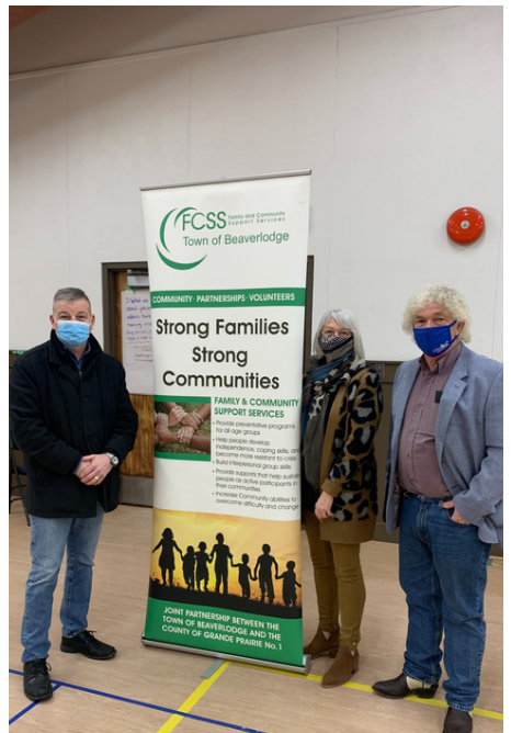
BEAVERLODGE FCSS INVOLVED IN ENGAGEMENT SESSION ON RURAL HOMELESSNESS