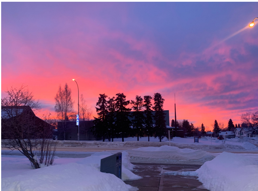
PEACE COUNTRY SUNRISE IN FRONT OF THE TOWN BUILDING

Beaverlodge FCSS and the Recreation Center are looking for donations of gently used hockey equipment. Skates, helmets, hockey gloves and sticks would be most appreciated. We are hoping to get a collection to have on hand for community members to use. If you or your kids have outgrown any and would like to donate, please drop off at the Recreation Center 1016 - 4th Ave.