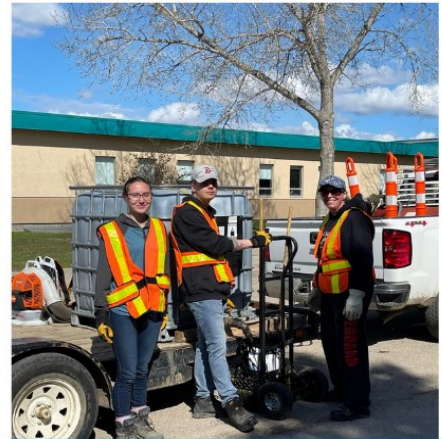
PUBLIC WORKS FILLING POTHOLES

The Town of Beaverlodge Beaver has been making appearances around town and at special events. Seems this Beaver is in need of a name....Stay tuned for information on that. :)