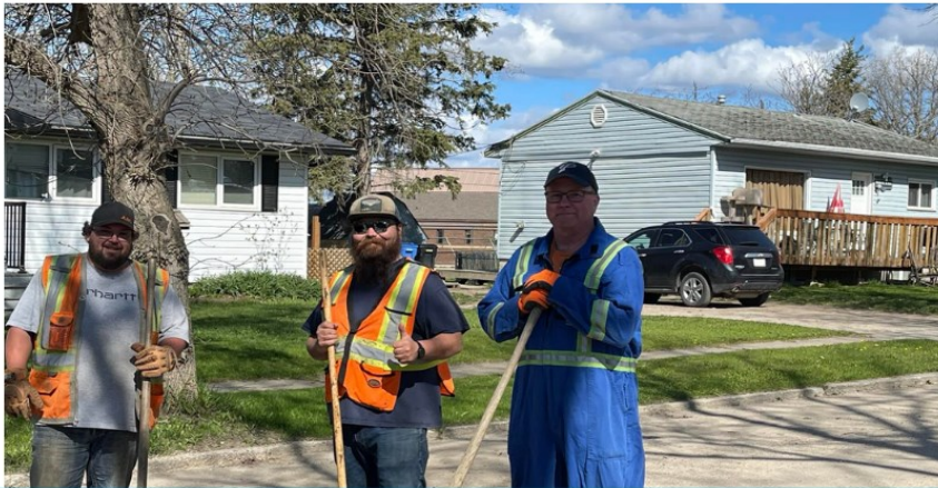
PUBLIC WORKS FILLING POTHOLES AROUND TOWN

The Town of Beaverlodge Public Works department are once again hard at work improving our streets. The weather finally cooperated enough for the asphalt plant to be up and running and crews were busy filling in potholes throughout the town. May 15- 22 was National Public Works Week where crews around the province were recognized for their hard work, dedication and resiliency.