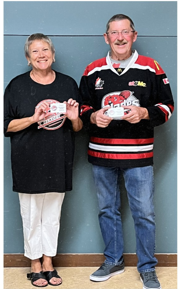
BEAVERLODGE BLADES FIRST SEASON TICKET HOLDERS