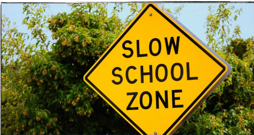
SCHOOL ZONES COME INTO EFFECT AUGUST 31