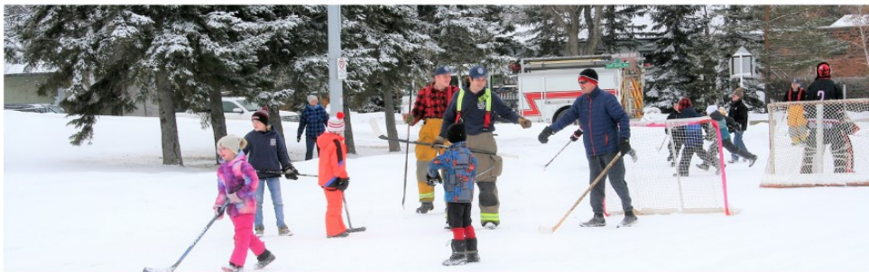
LOTS OF RESIDENTS CAME OUT TO ENJOY SOME COMMUNITY CONNECTIONS