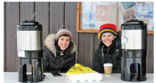
BEAVERLODGE ALLIANCE CHURCH SUPPLIED HOT CHOCOLATE