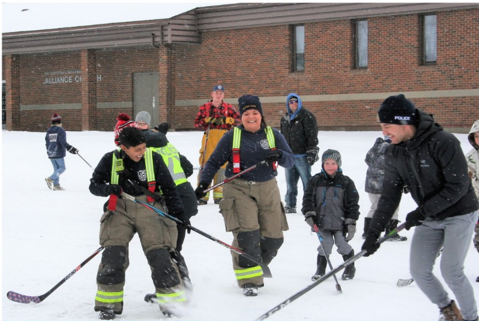
MEMBERS FROM RCMP, FIRE AND EMS WERE RIGHT IN THE MIDDLE OF THE ACTION FAMILY DAY