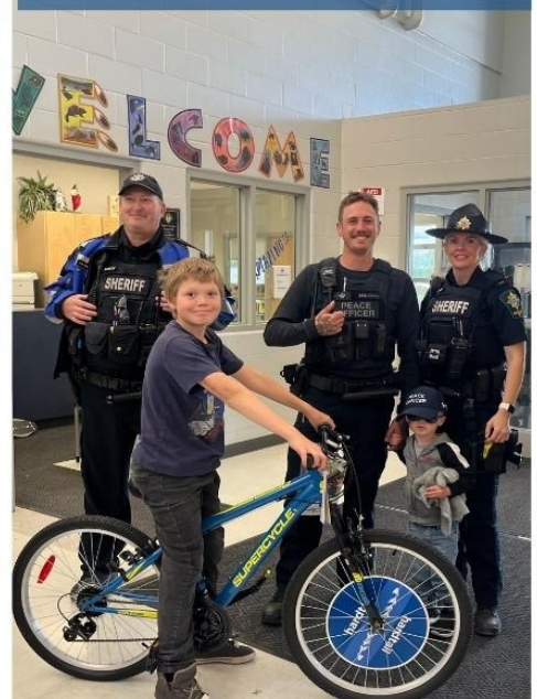
BIKE ROAD-EO WINNER