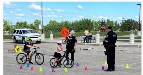
BIKE ROAD-EO FUN