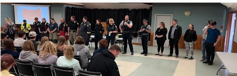
THE FIRST RESPONDERS WHO HELPED MAKE THIS EVENT HAPPEN