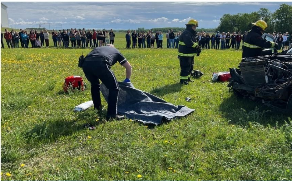
TRAUMA DRAMA RETURNS FOR GRADE 9 STUDENTS

At the end of the day all participants names were entered into a draw for a brand new bike donated by Anytime Towing!