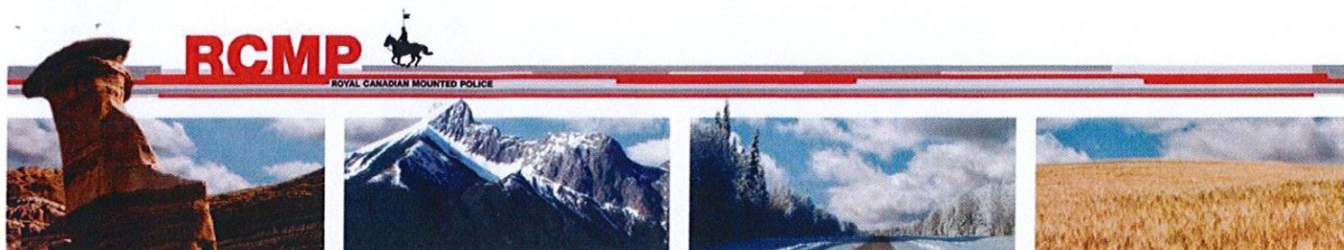
Provincial Police Service Composition Table 2