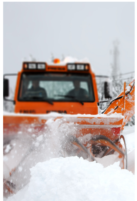
MAIN STREET SNOW REMOVAL HAPPENING TUESDAYS