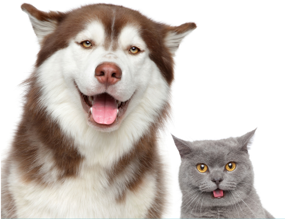
TIME TO RENEW YOUR PET LICENCES

BUSINESS LICENSES: All businesses require a license in Beaverlodge. Existing Business Licenses will expire December 31, 2023. 2024 licenses must be purchased before January 31, 2024.