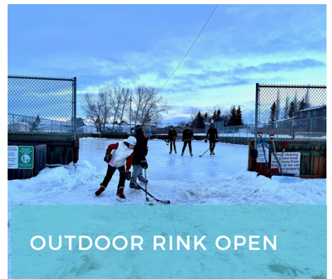
OUTDOOR RINK OPEN

Embrace the winter wonder, share laughter, and enjoy the community spirit.