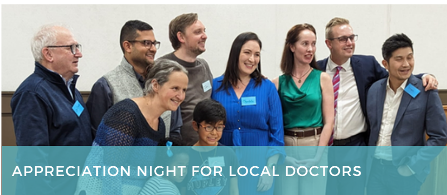
APPRECIATION NIGHT FOR LOCAL DOCTORS