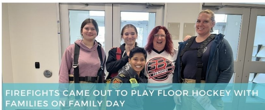
FIREFIGHTS CAME OUT TO PLAY FLOOR HOCKEY WITH FAMILIES ON FAMILY DAY