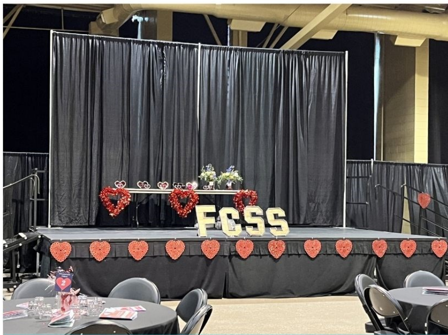
PASSIONATE HEART AWARDS FEBRUARY 14, 2024

Nomination forms are available at the Town Office, Recreation Centre, and Public Library. Deadline for nominations: March 28, 2024. Let's honor those who make a difference in our town's fabric by acknowledging their invaluable contributions.