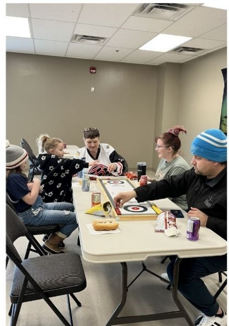
FAMILIES ENJOYED SOME QUALITY TIME PLAYING BOARD GAMES